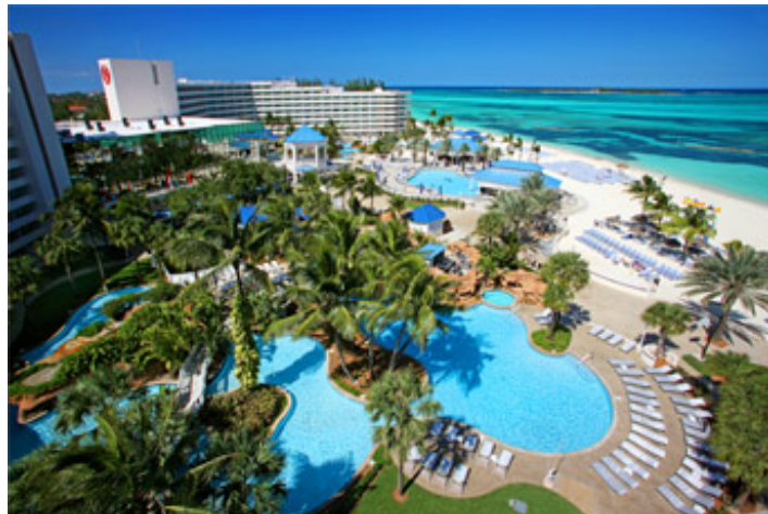
Picture yourself here on your next girlfriend getaway

The all-new Sheraton Cable Beach Resort in Nassau has a Girlfriend Getaway Package that will have you sipping and snorkeling. Included are an ocean view room, breakfast every day, a welcome cocktail at the Telegraph Bar and wine and cheese in your room on arrival. The resort has 694 guest rooms and suites, all with balconies, three pools, a swim-up bar and six restaurants and lounges. Rates start at $309 a person, with a three-night minimum. www.sheraton.com/cablebeach .