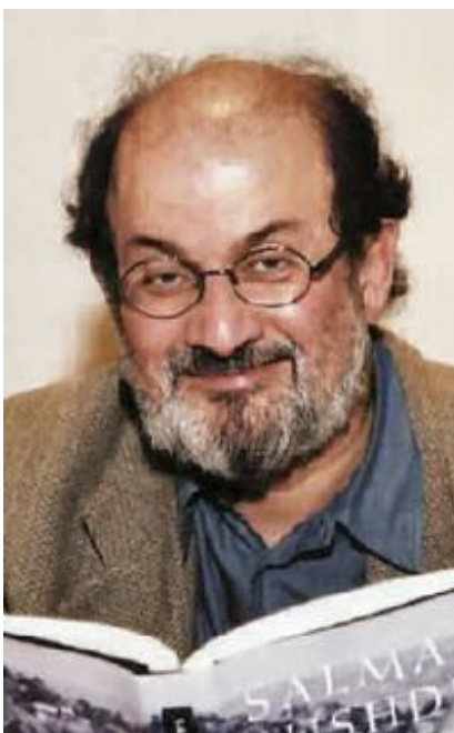
Share your worldviews with Salman Rushdie at Las Ventana's in Los Cabos.

"And then Salman says to me ..." Imagine telling your friends about your chat with Salman Rushdie after your next vacation! You can do just that at Enchanted Evenings with Salman Rushdie at Las Ventana's al Paraiso in Los Cabos September 4-7. In addition to older works, the celebrated author will discuss his new novel The Enchantress of Florence at a reception and two dinners. For more information, please contact Las Ventana's' at 310-824-7781. For Las Ventana's reservations call 888-767-3966, www.rosewoodhotels.com